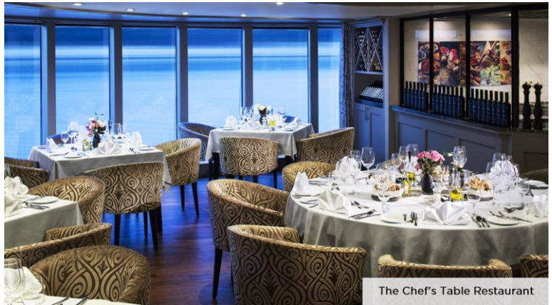
The Chef's Table Restaurant