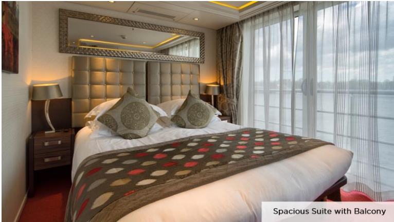
Spacious Suite with Balcony

7-night cruise | July 29-August 5, 2026 | Aboard AmaPrima